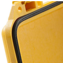
1703 Replacement O-ring