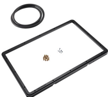
1500PF Special Application Panel Frame