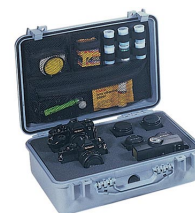
1508 Photographer's Lid Organizer