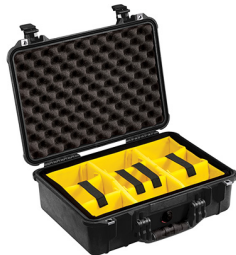
1504 With Padded Dividers