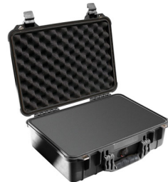
1500WF With Foam