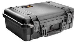
1500NF No Foam