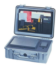
1509 Lid Organizer