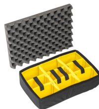
1505 Padded Divider Set