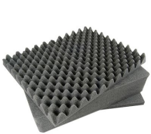
1501 3 pc. Replacement Foam Set