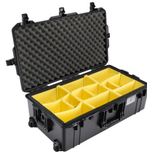
1615WD With Padded Dividers