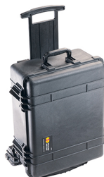
1560MNF No Foam