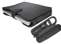
1495CBI Computer Bottom Insert