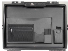
1495ALI Attache/Computer Lid Insert