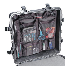
0359 Lid Organizer