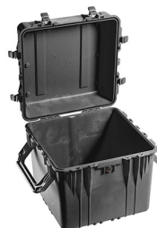
0350NF No Foam