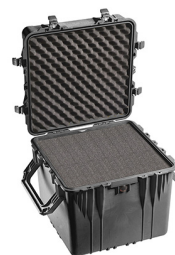
0350WF With Foam