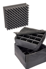
0355 Padded Divider Set