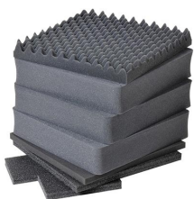
0351 7 pc. Replacement Foam Set