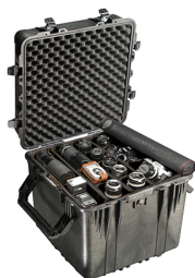
0354 With Padded Dividers