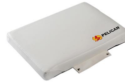
35QSEAT Seat Cushion - White