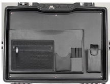
1495ALI Attache/Computer Lid Insert