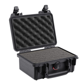
1120WF With Foam