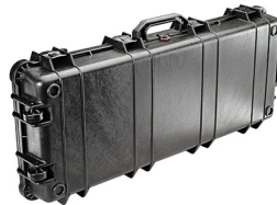
1700NF No Foam