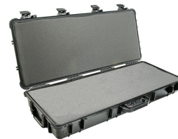
1700WF With Foam