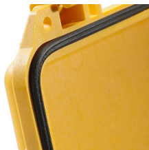
1703 Replacement O-ring