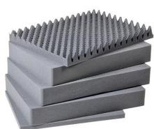
1661 5 pc. Replacement Foam Set

Wheels 4 Extendable Handle yes Master Pack 1 Nameplate yes Reduced Area yes Military yes