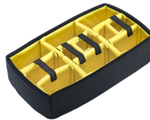
1515 Padded Divider Set