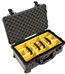
1514 With Padded Dividers