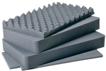
1511 4 pc. Replacement Foam Set