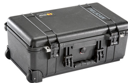
1510NF No Foam