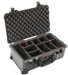
1510TP With TrekPak Divider System