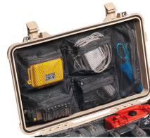
1519 Lid Organizer