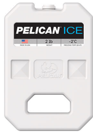
PI-2LB 2lb Ice Pack

Pelican 23215 Early Ave • Torrance, CA 90505 USA • Phone: (310) 326-4700 • (800) 473-5422 • Fax: (310) 326-3311 sales@pelican.com • www.pelican.com