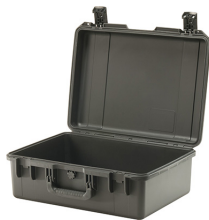
iM2600-X0000 No Foam