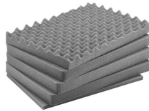
iM2600-FOAM 5 pc. Replacement Foam Set