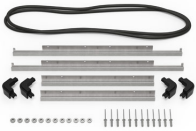
iM2600-BEZEL-LID Lid Bezel Kit