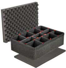
iM2600TPKIT TrekPak Case Divider Kit