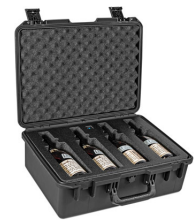
WHISKY-MULTIB Quad Whiskey