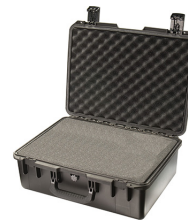
iM2600-X0001 With Foam