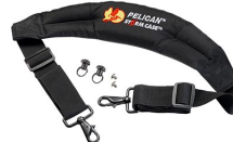
iM-STRAP-S-VER2 Padded Shoulder Strap