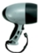
Metallic Pewter Grey NEMO

NEMO 4C is a fashionable and handy flashlight identical to the 8C only smaller. It provides a powerful light of 60.000 candle power, 112 lumen and 6.9 Watt, which is designed to use under water or as a general flashlight due to its high-technology features. It has a battery burn time of 3.5 hours and a lamp life of 30 hours.