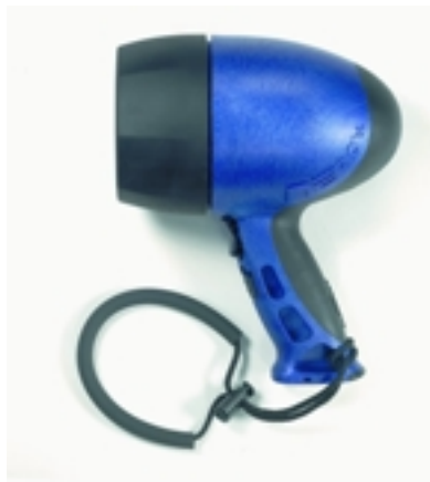
The new flashlights NEMO 8C and 4C developed by Peli Products for diving applications.