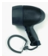
Black Onyx NEMO

NEMO 8C and NEMO 4C are both submersible to 150 meters, available in the same colours and have the same design. The differences between them is the size, the power of their beam of light and the fact of being 8C and 4C. These are two new products from Peli as always covered under the Unconditional Guarantee forever .