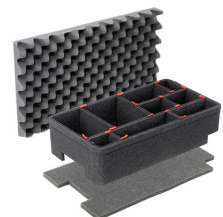
1510TPKIT TrekPak Case Divider Kit