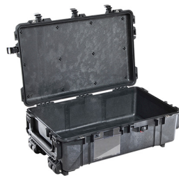
1670NF No Foam