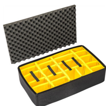
1675 Padded Divider Set