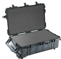
1670WF With Foam