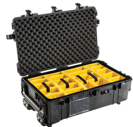
1674 With Padded Dividers