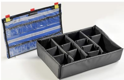
1505EMS EMS Accessory Set (Lid Organizer and Divider Set)