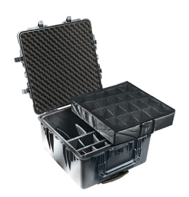
1644 With Padded Dividers