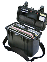
1437 With Padded Office Divider Set & Lid Organizer