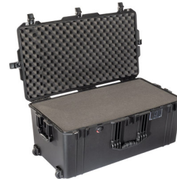
1646WF With Foam