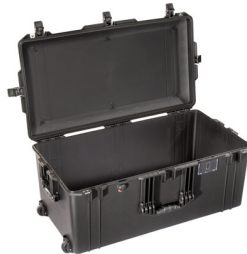
1646NF No Foam