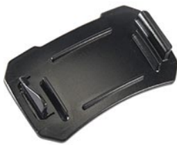
2748 Strapless Headlamp Adapter