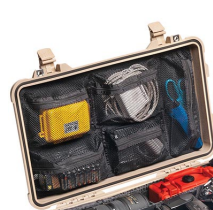
1519 Lid Organizer