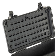
1510MP EZ-Click™ MOLLE Panel