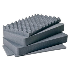
1511 4 pc. Replacement Foam Set