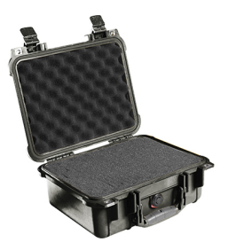
1400WF With Foam