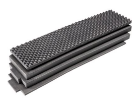
1755AirFS 4 pc. Replacement Foam Set