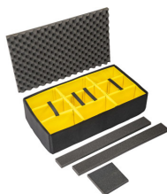
1615AirDS Padded Divider Set