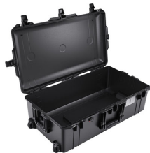
1615NF No Foam