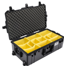
1615WD With Padded Dividers