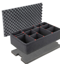
1615TPKIT TrekPak Case Divider Kit