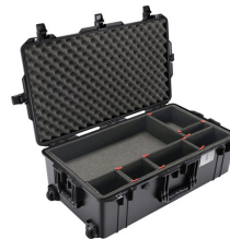
1615TP With TrekPak Divider System