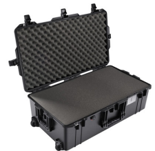
1615WF With Foam