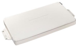
70Q-SEAT-WHT Seat Cushion - White