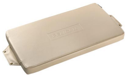
70Q-SEAT-TAN Seat Cushion - Tan