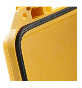
1073 Replacement O-ring