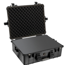
1600WF With Foam