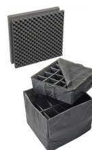
0375 Padded Divider Set