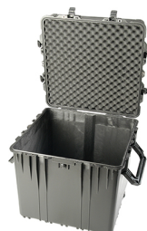
0370NF No Foam