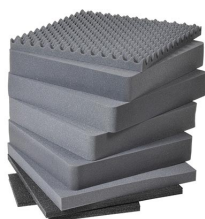
0371 8 pc. Replacement Foam Set