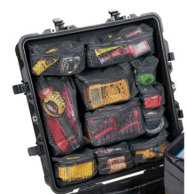
0379 Lid Organizer