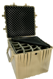
0374 With Padded Dividers