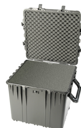
0370WF With Foam