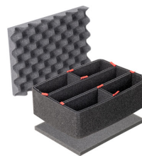
1400TPKIT TrekPak Case Divider Kit