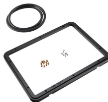
1400PF Special Application Panel Frame