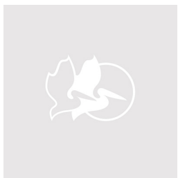
BG055TRAYRAIL Spacecase Tray