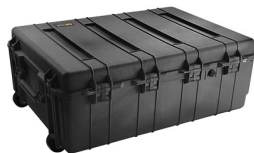
1730NF No Foam