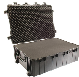
1730WF With Foam