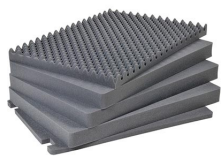
1731 5 pc. Replacement Foam Set