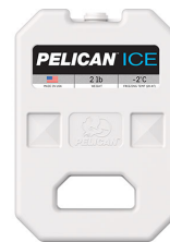
PI-2LB 2lb Ice Pack

23215 Early Ave • Torrance, CA 90505 USA • Phone: (310) 326-4700 • (800) 473-5422 • Fax: (310) 326-3311 sales@pelican.com • www.pelican.com