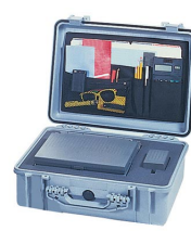
1509 Lid Organizer