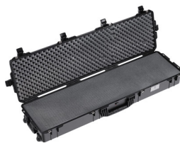
1755WF With Foam