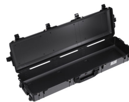
1755NF No Foam