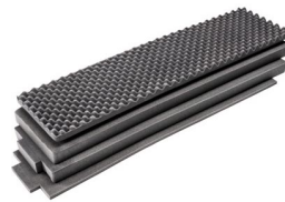
1755AirFS 4 pc. Replacement Foam Set