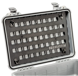
1500MP EZ-Click™ MOLLE Panel