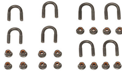
RFMTTC2 Roof Mount Tubular Clamp Kit