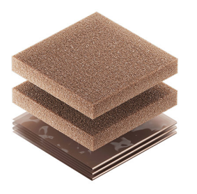
1500CI Corrosion Intercept Kit