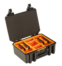
V300WD With Padded Dividers