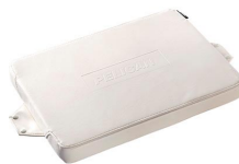
50Q-SEAT-WHT Seat Cushion - White