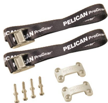
TDKIT Tie Down Kit