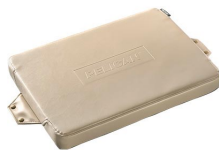
50Q-SEAT-TAN Seat Cushion - Tan