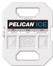
PI-5LB 5lb Ice Pack