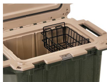
50-WB Dry Rack Basket